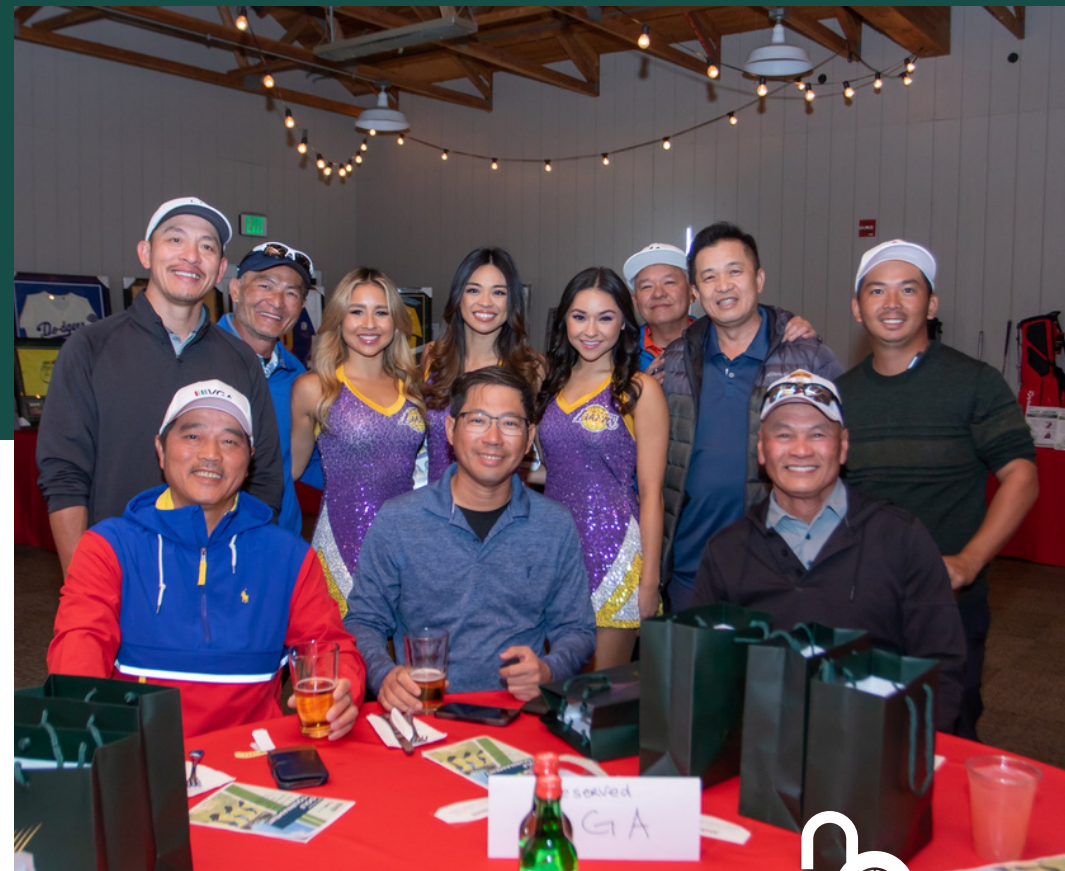
PHOTO OPS WITH AMBASSADORS